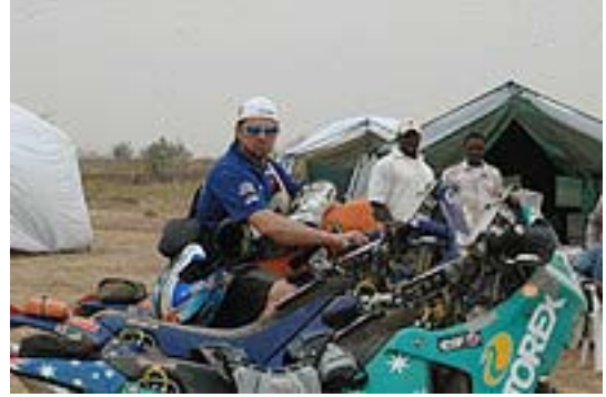
Cyril Despres in Bamako