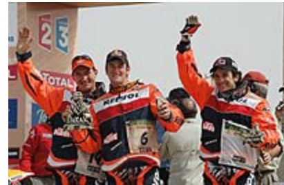
Team KTM Repsol-Red Bull