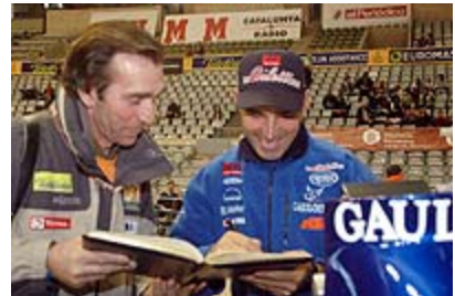
Rally Dakar 2005 in Barcelona