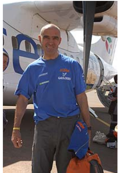
Rally Dakar 2004