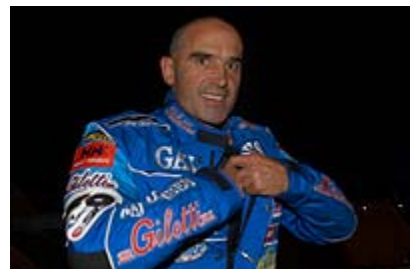
Fabrizio Meoni 1957-2005