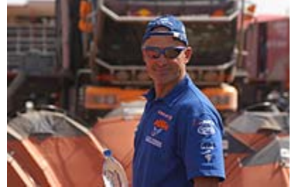
Rally Dakar 2004