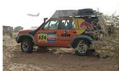
Assistance Car in Kiffa