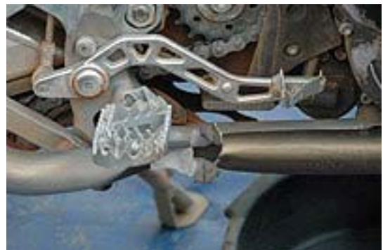
kaputter Auspuff Motorrad Cyril Despres