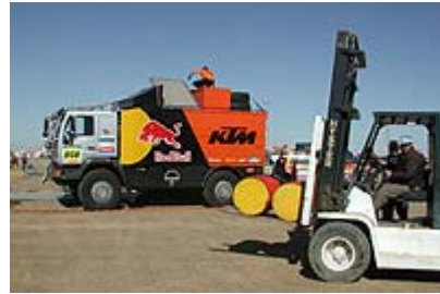
Im Bivak von Smara