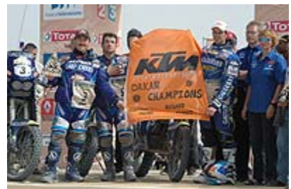
Team KTM Gauloises