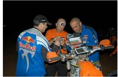
Rally Dakar 2004