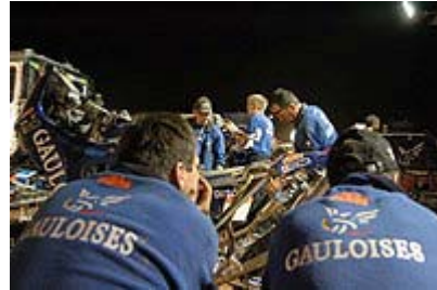
Team KTM Gauloises, Camp Kiffa