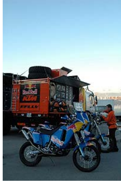
Team KTM Red Bull USA: The Bikes

In any case, we keep at it for you daily. Stay tuned!