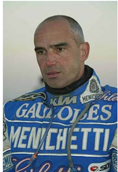
Rally Dakar 2003