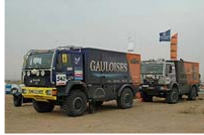
MAN Service Truck

Tomorrow the competitors have to challenge a 483 km and extremely tough special. It loops around the bivouac in Atar. The organizers call it the most difficult dunes of the rally. They are located in the Erg El Beyyed. Before they are reached the participants will have to climb the Thanga crossing. The weather in Mauritania makes the stage even more difficult. There is still a strong wind blowing and the vision is extremely low. This afternoon the desert faced another phenomenon: It started to rain!