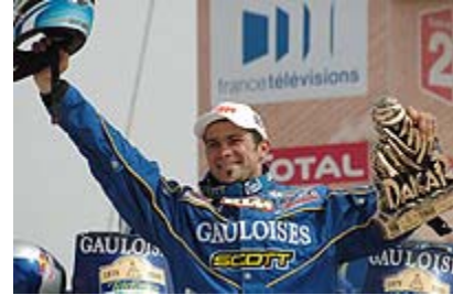
Cyril Despres: Gewinner Rally Dakar 2005