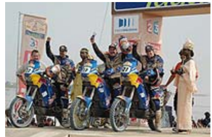
Team KTM Red Bull USA