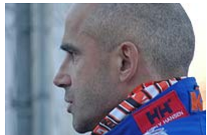
Rally Dakar 2005