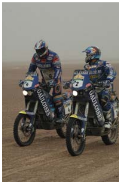
Fabrizio Meoni und Cyril Despres