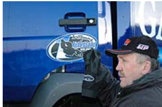
In Memory of Richard Sainct