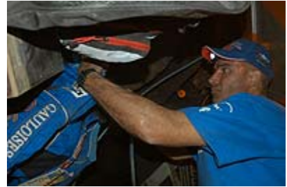
Rally Dakar 2004