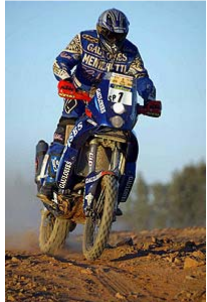
Rally Dakar 2003

His 13th Dakar Rally should become his last. Already one year ago he had promised his family to stop racing altogether. He wanted more time for his wife and his two children. His small daughter is barely two