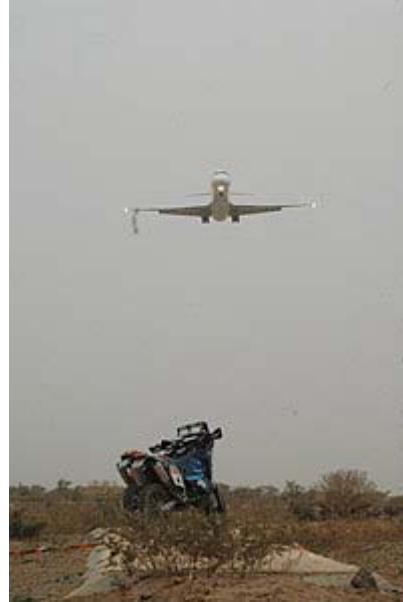
Rallypause in Atar