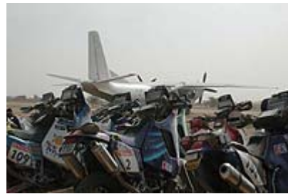
Kiffa - Parc Fermé