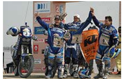
Team KTM Gauloises