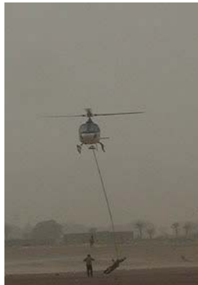
Privatiers werden ausgeflogen nach Tichit Private riders fly to Tichit